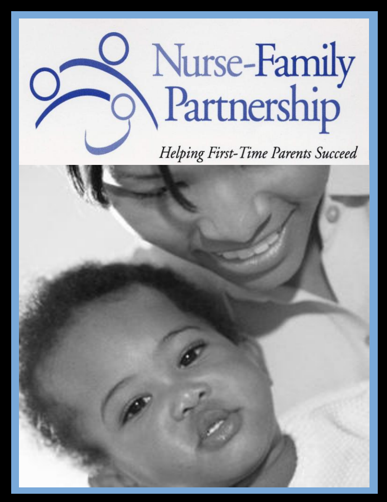
NFP Slides Courtesy of David Olds, PhD